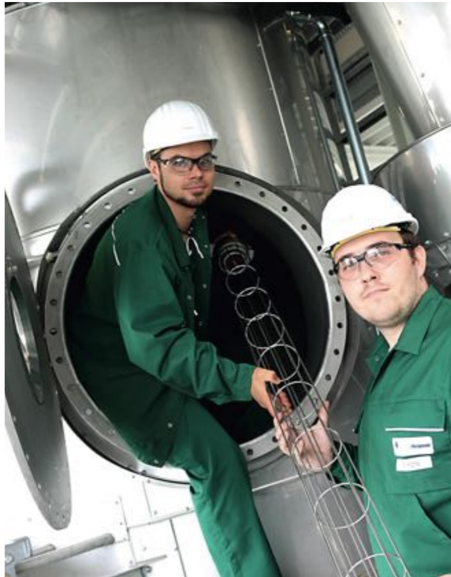
IPT - PERGANDE, GESELLSCHAFT FÜR INNOVATIVE PARTICLE TECHNOLOGY MBH, ANHALT-BITTERFELD

Further information can be found in the BMAS brochure on the subject of protection against dismissal . If you are affected by a dismissal, seek advice from a lawyer or an advice centre as soon as possible.