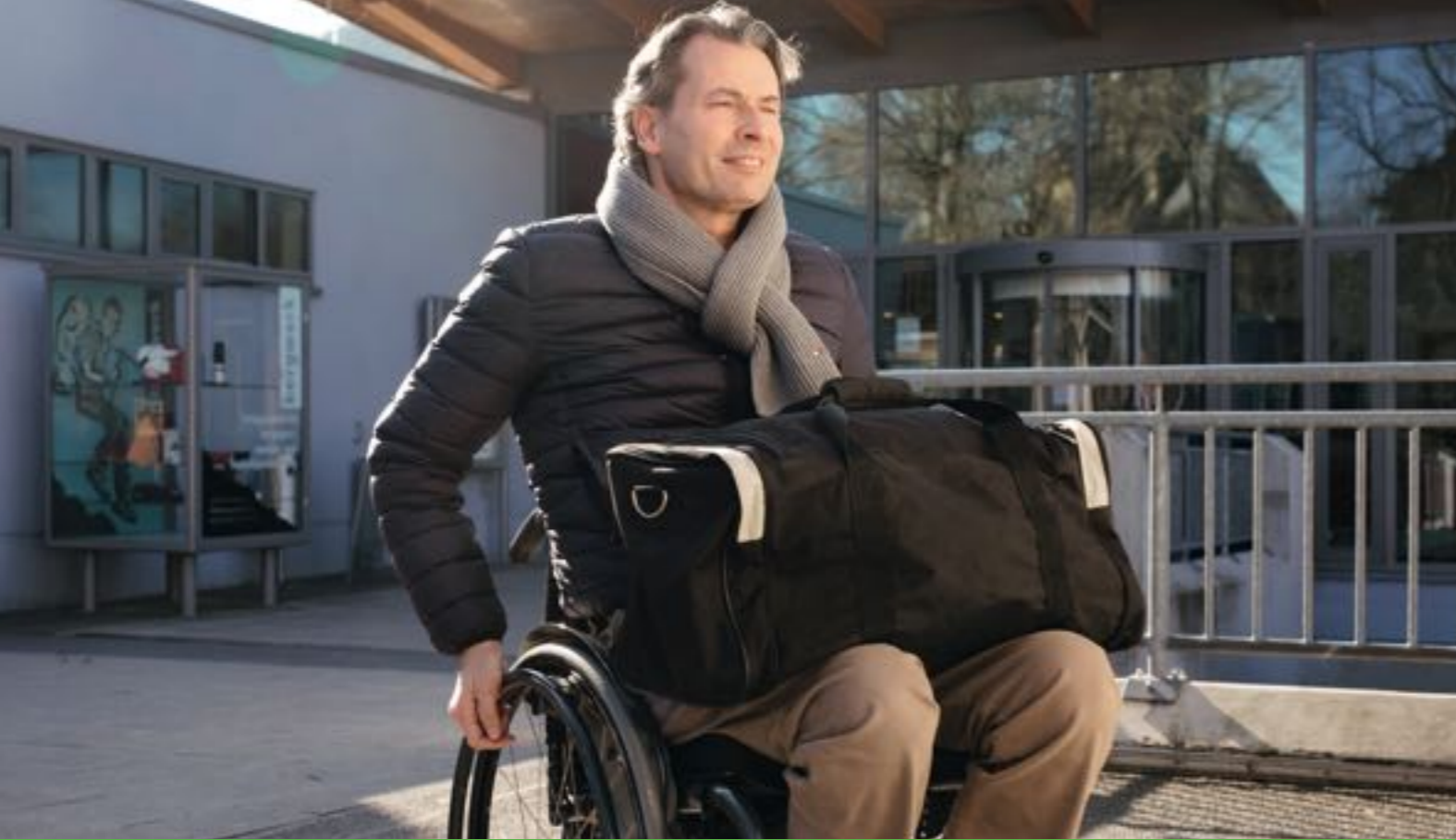
VISIT TO THE BODETAL THERME IN THALE IN THE HARZ MOUNTAINS