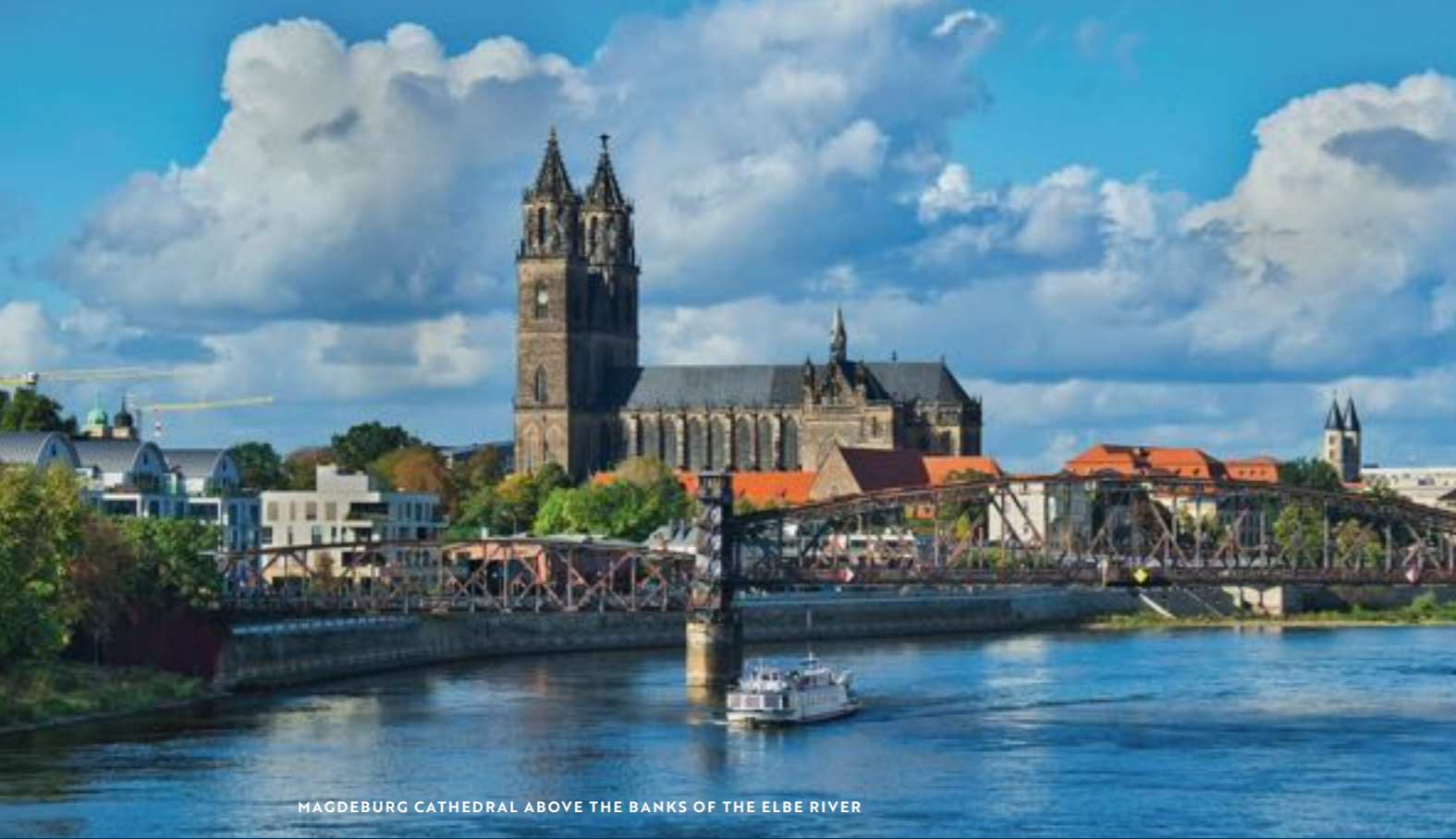
MAGDEBURG CATHEDRAL ABOVE THE BANKS OF THE ELBE RIVER