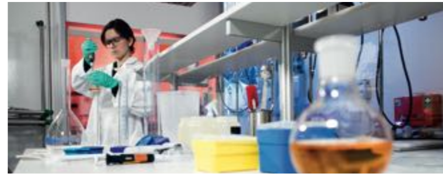
LABORATORY WORK AT HEPPE MEDICAL CHITOSAN GMBH, HALLE