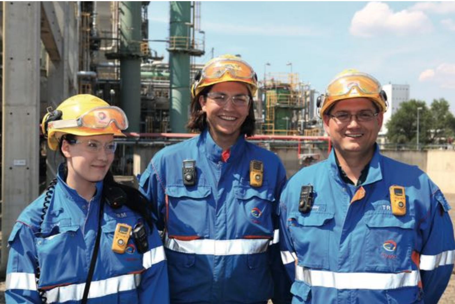
TOTAL REFINERY, SAALE DISTRICT