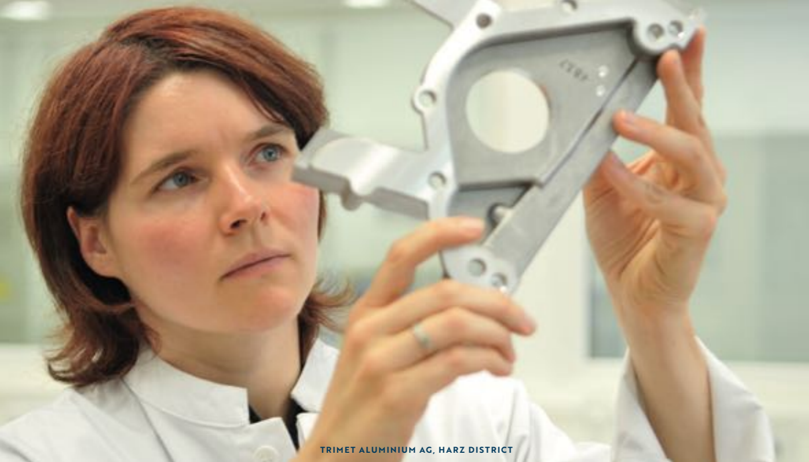
TRIMET ALUMINIUM AG, HARZ DISTRICT