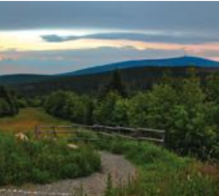
HARZ NATIONAL PARK

Saxony-Anhalt is regarded by our European neighbours as a federal state with low housing and living costs and high standards of quality. Rental prices are very similar to those in eastern Europe, in some cases even considerably cheaper. They are also significantly lower than in western Germany. In small towns and rural areas, buying a home is also cheaper than in Poland or Italy, for example. The general cost of living in Saxony-Anhalt is sometimes lower than in some European countries. It is not only in the pulsating larger cities of Saxony-Anhalt that there are residential areas in a good state of repair with an attractive living environment. In many places, excellently restored historic town centres, well-maintained green spaces and well-developed infrastructures help both locals and immigrants to feel at home here.