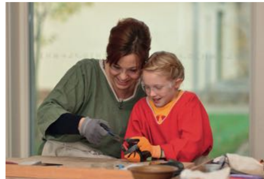
IN THE KINDERDOMBAUHÜTTE AT NAUMBURG CATHEDRAL