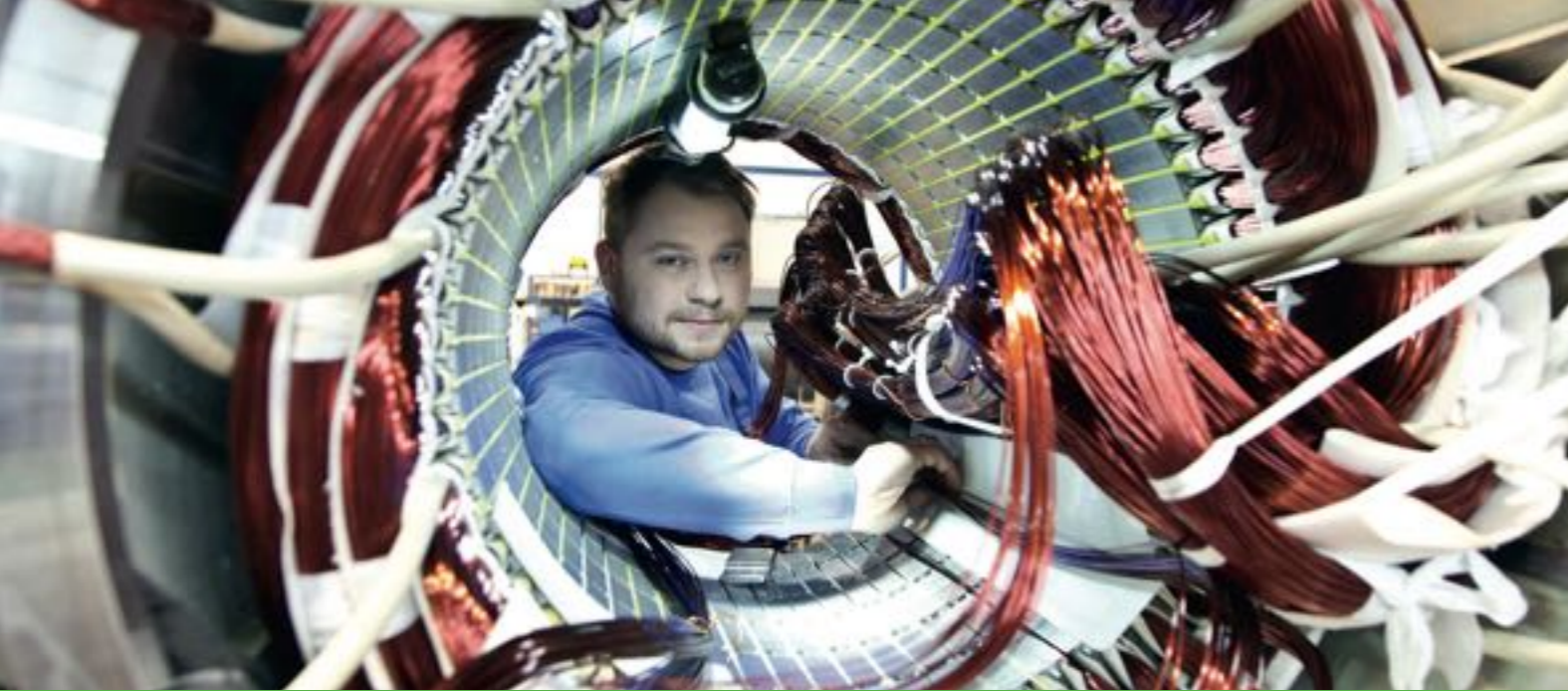
AEM-ANHALTISCHE ELEKTROMOTORENWERK DESSAU GMBH, SAXONY-ANHALT