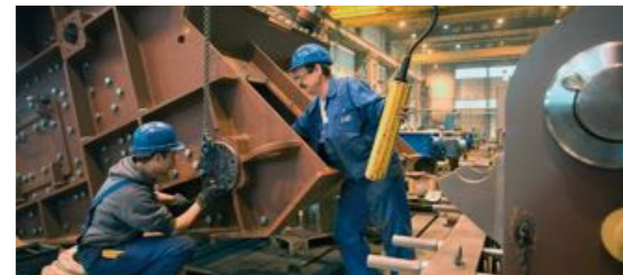
FAM MAGDEBURGER FÖRDERANLAGEN UND BAUMASCHINEN GMBH

If you are entitled to social benefits in Germany, this also applies to your family members living in Germany.