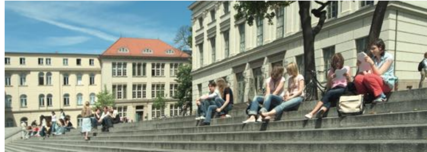
MARTIN LUTHER UNIVERSITY HALLE-WITTENBERG

During the training period, you receive remuneration from the training company.