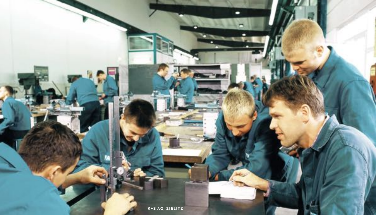
K+S AG, ZIELITZ