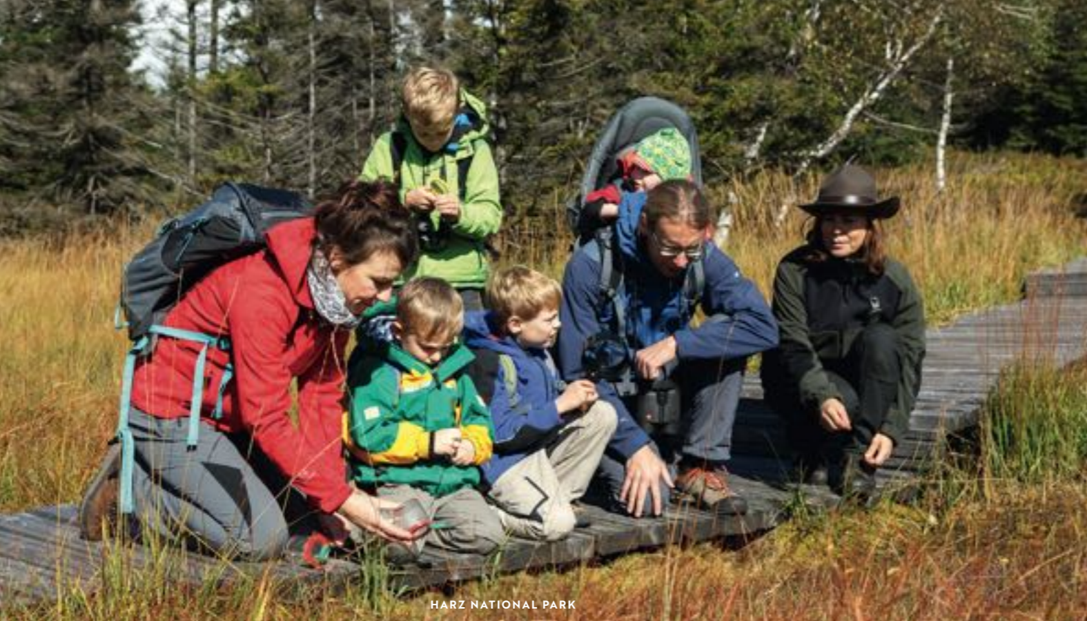
HARZ NATIONAL PARK