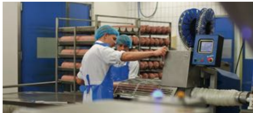
ALTMÄRKER FLEISCH UND WURSTWAREN GMBH, LANDKREIS STENDAL