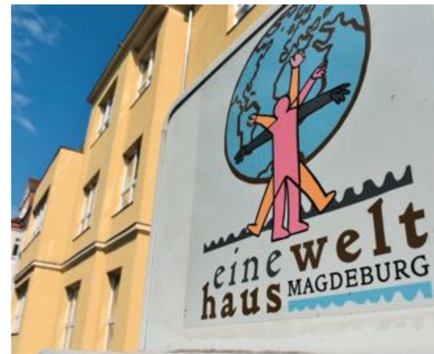
EINEWELT HAUS IN MAGDEBURG, HEADQUARTERS OF THE AUSLANDSGESELLSCHAFT SACHSEN-ANHALT E.V.

As an EU national, you vote or stand as a candidate under the same conditions as nationals of your country of residence. If nationals have to have lived in the country or municipality for a certain period of time in order to be allowed to vote or stand as a candidate, this also applies to you.